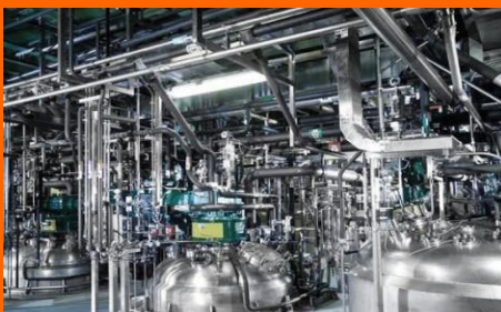
Industrial Reactors Fabrication