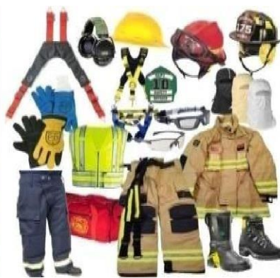
Safety Personal Protective