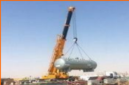
Mechanical Erection Work