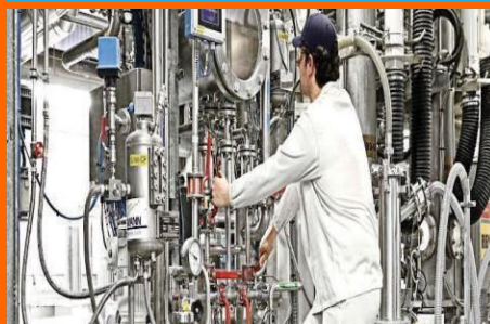
Mechanical Maintenance Work