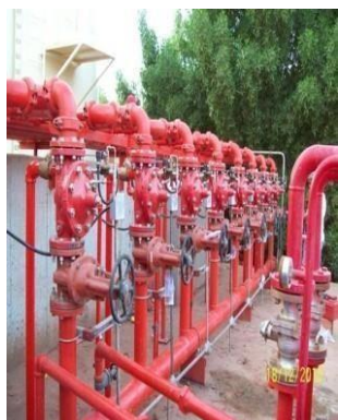
Fire Hydrant System