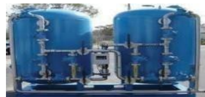
PSF & ACF