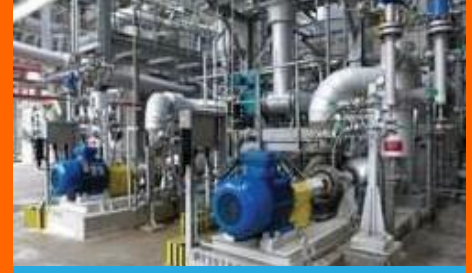
Industrial piping & Pump Erection