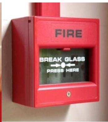
Fire Alarm Control Panel