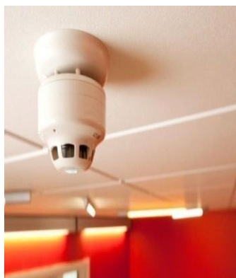
Smoke and heat detectors