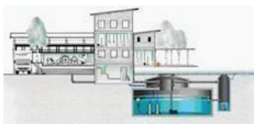
RAIN WATER HARVESTING SYSTEM