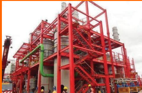
Mechanical Equipment and Structure Fabrication Work