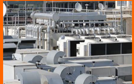
HVAC System Installation