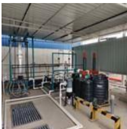
CIVIL TYPE PLANT