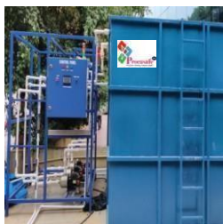
PACKAGED TYPE PLANT