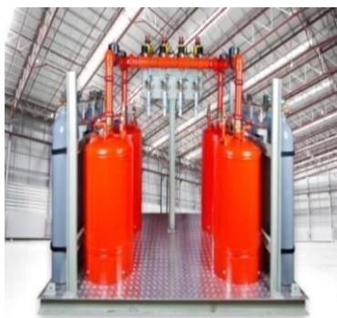
Fire Suppression System