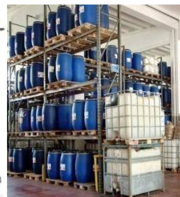
ETP & STP treatment chemicals Equipments