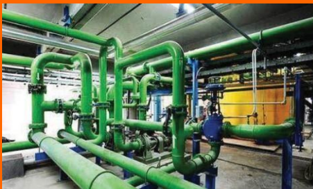
Cool water Pipe Line Erection